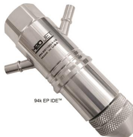
94k EP IDE™