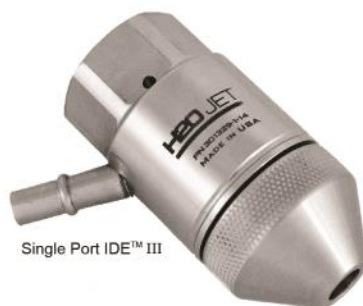
Single Port IDE™ III